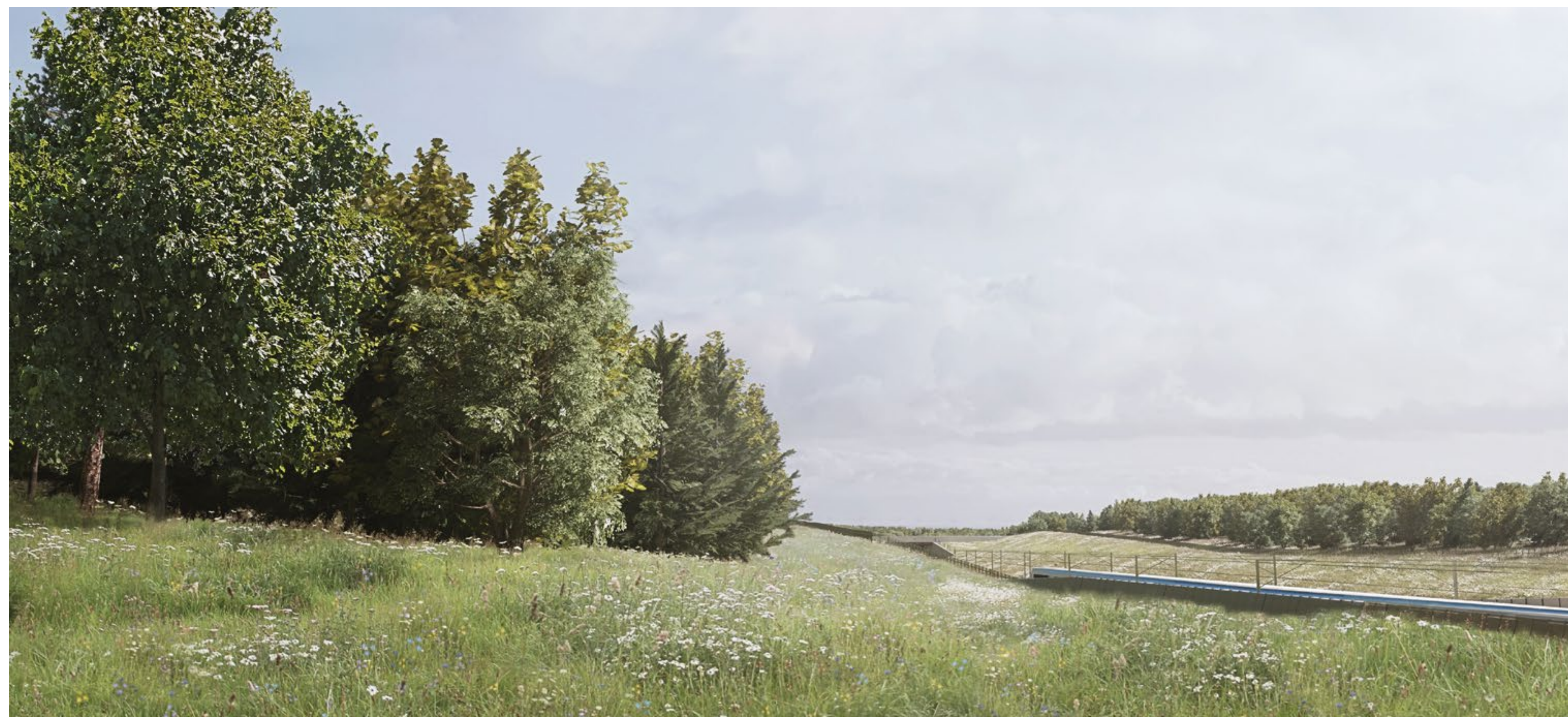
Visualisation - View from the Tilehouse cutting viewing area 4, looking north east (Year 15)

In other locations, where HS2 infrastructure has the potential to be an unattractive element, views of the railway are typically concealed using a combination of planting and/or landform.