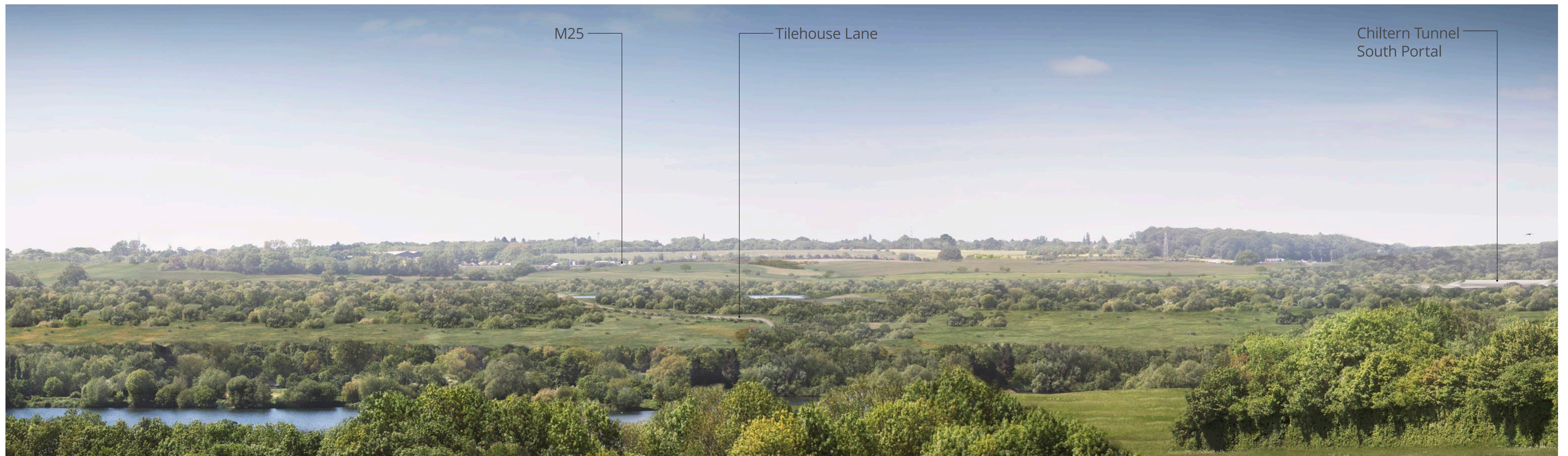
Visualisation - Ground level view from Park Lane, Harefield looking west (Year 15)