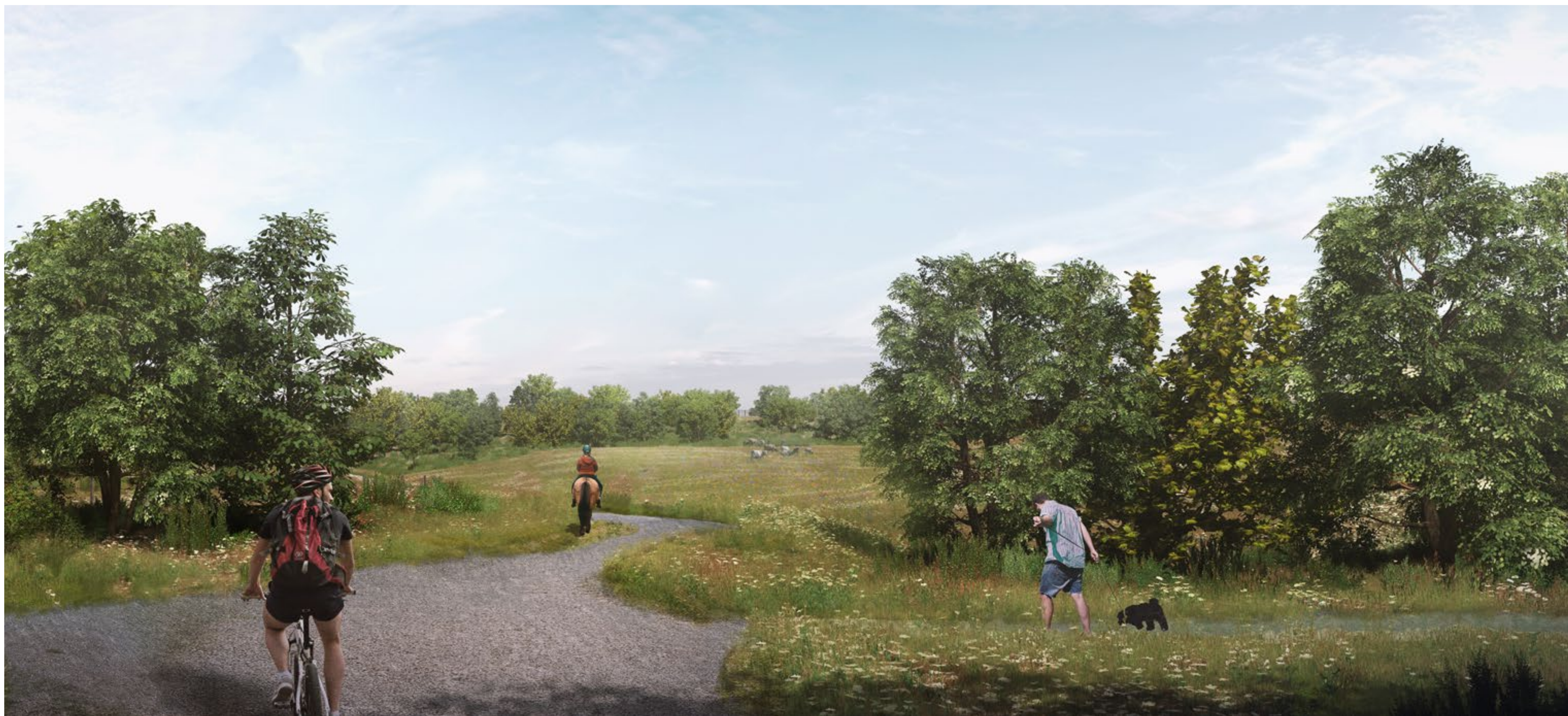
Visualisation - Ground level view from footpath Rickmansworth 004 looking south west (Year 15)

These routes will be connected to the wider footpath and cycle network where they meet with the CVWS boundary, and will form part of a broader recreational offer which will be delivered by the HS2 project.