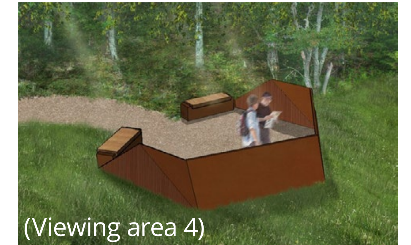
(Viewing area 4)