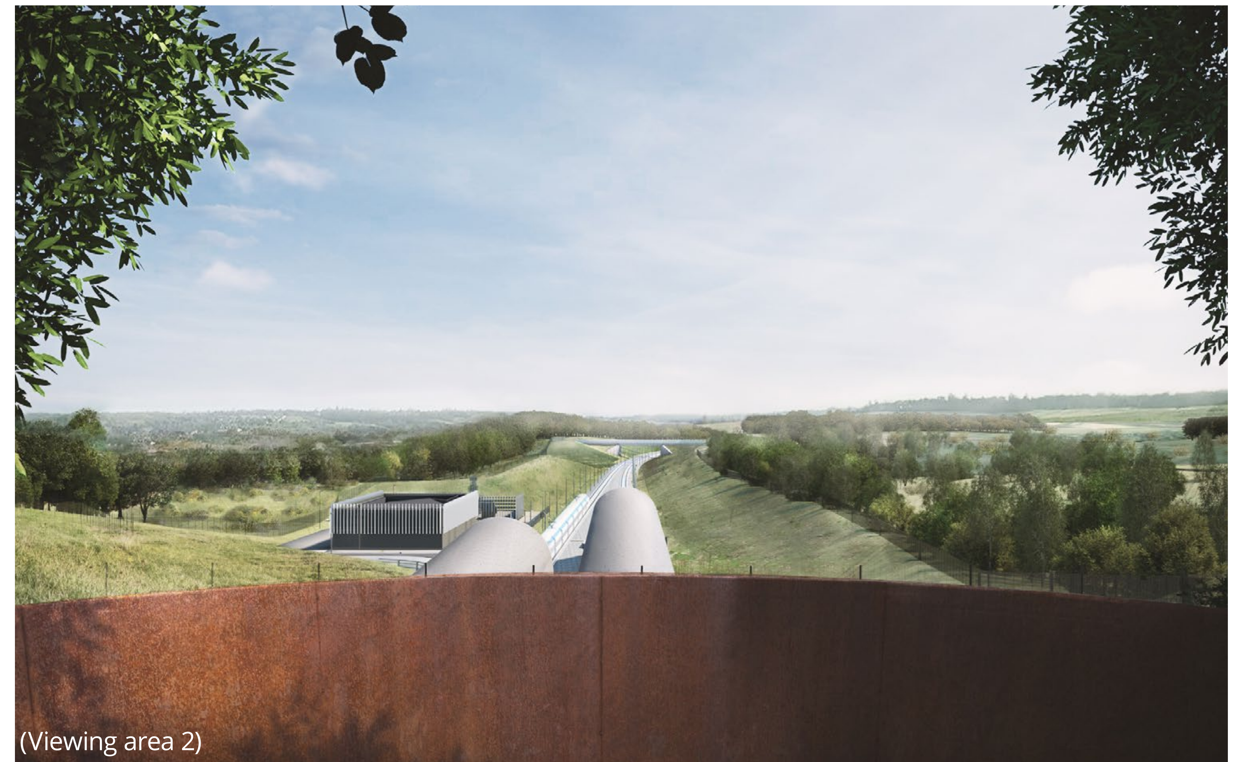
(Viewing area 2)