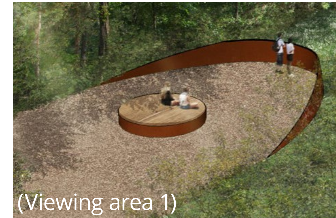
(Viewing area 1)