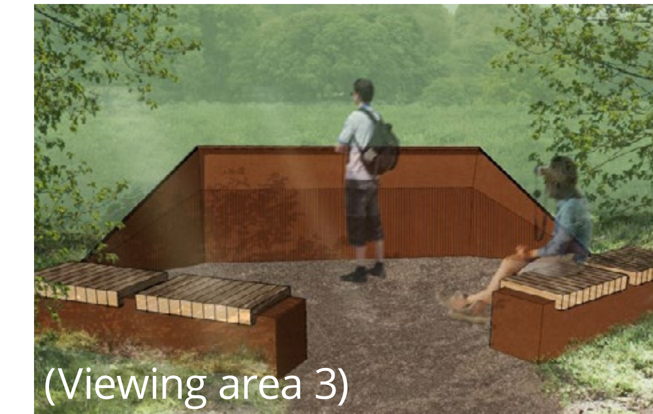
(Viewing area 3)